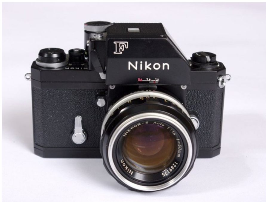
A Nikon F SLR camera

During the heyday of film, Kodak had two totally separate divisions, one for the consumer market with films such as Kodacolor, and a second professional division with film and paper aimed at the professional and pro-lab market. At the most basic, the Eastman Kodak Company was a chemical company, and their product was chemical-based photography.